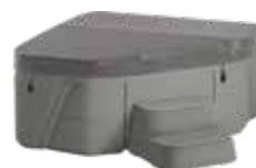
Taupe shell with Slate cover