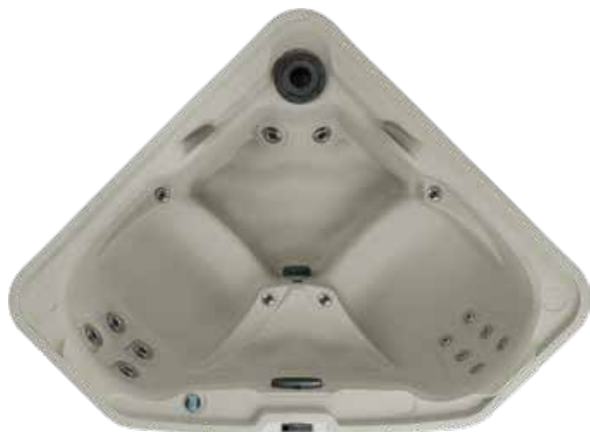
Tristar shown in Sand