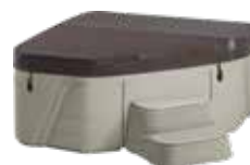
Sand shell with Chestnut cover