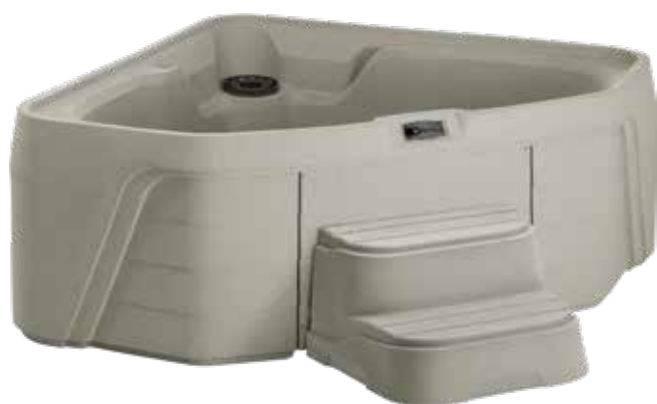
Tristar shown in Sand