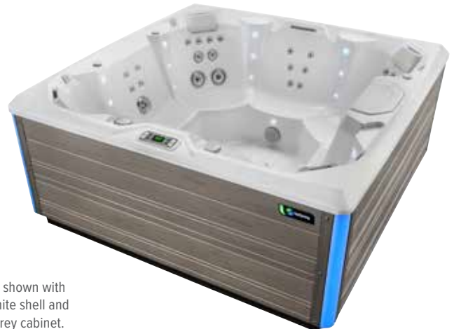
Pulse spa shown with Alpine White shell and Coastal Grey cabinet.