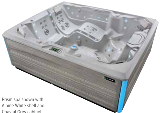
Prism spa shown with Alpine White shell and Coastal Grey cabinet.