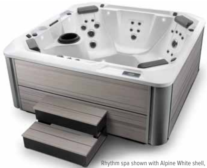
Rhythm spa shown with Alpine White shell, Almond cabinet and Almond Hot Spot Collection Step.