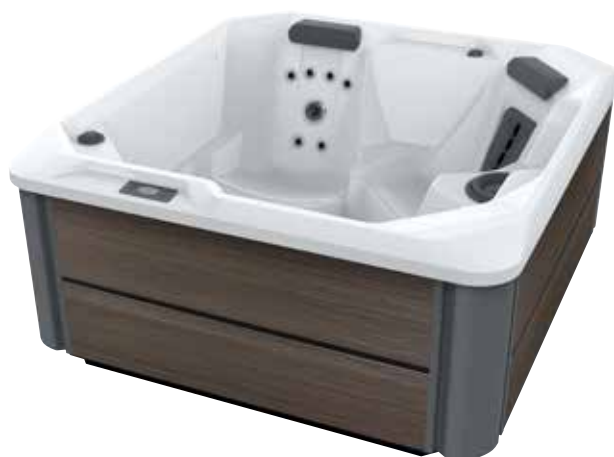
SX spa shown with Alpine White shell and Havana cabinet.